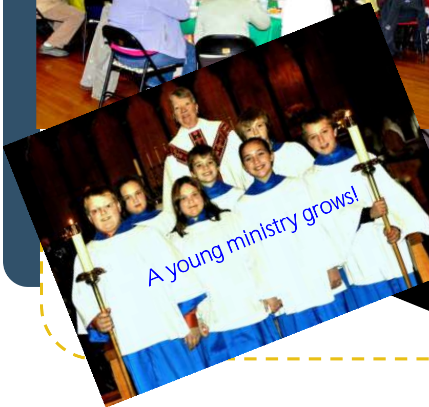
A young ministry grows!